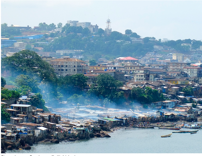
Sierra Leone, Freetown.

To combat landslide risk and rising urban heat stress, the Resilient Urban Sierra Leone Project is supporting the capital city of Freetown in the restoration of its canopy cover through community-based reforestation.