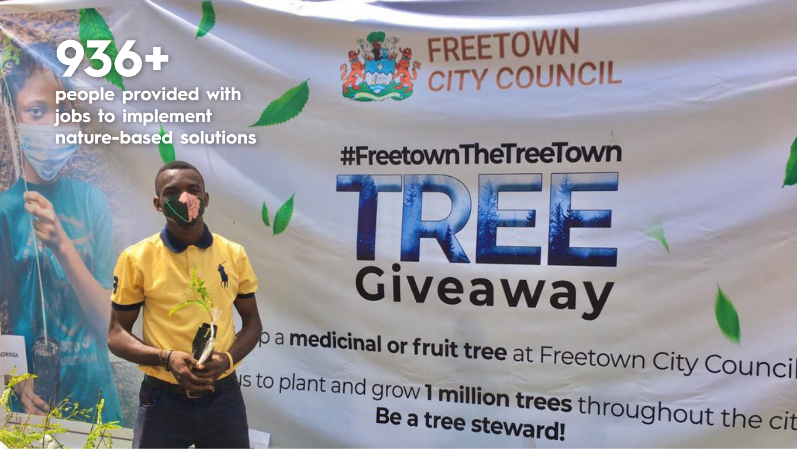
FIGURE 1. Innovative digital tools can support communitybased nature-based solutions